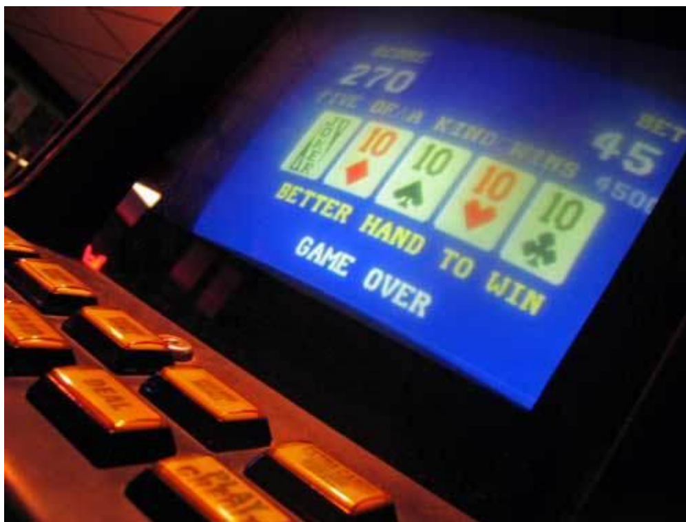
Potentially illegal machine

As intended the majority of visits carried out led to advice. One premise was found to have in use gaming machines that the Gambling Commission had identified as potentially illegal. The Gambling Commission was provided details.