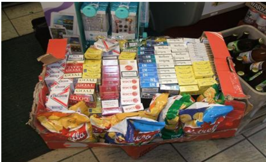
Tobacco products as found by the dog